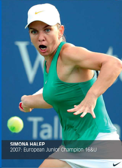
SIMONA HALEP 2007: European Junior Champion 16&U