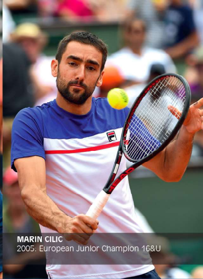
MARIN CILIC 2005: European Junior Champion 16&U