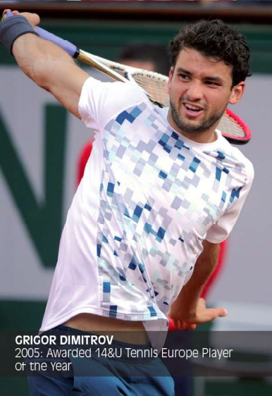
GRIGOR DIMITROV 2005: Awarded 14&U Tennis Europe Player of the Year