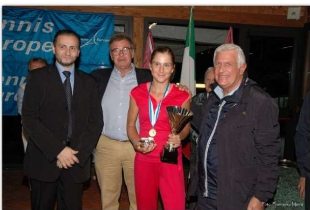
Belinda Bencic al CT Polimeni nel 2011