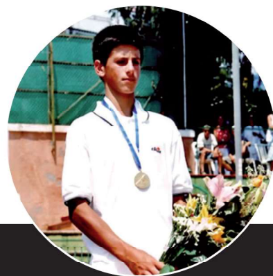
The Tennis Europe Junior Tour has proven to be a fruitful training ground for worldclass players such as Novak Djokovic, pictured here with his European Junior Championships gold medal in 2001.

As the tour goes from strength to strength, so does its appeal. Some 420,000 spectators attend Tennis Europe Junior Tour events each year to see around 12,000 young talents from over 110 countries take their first steps on the international tennis stage. Aside from extensive coverage at TennisEurope.org, reports about the Tour in over 900 newspapers and magazines and over 14,000 minutes of annual radio and TV airtime ensure that every day, people are learning about the latest players to follow in the footsteps of stars like Rafael Nadal, Andy Murray, Caroline Wozniacki and Maria Sharapova in celebrating some of their earliest successes on the Tennis Europe Junior Tour.