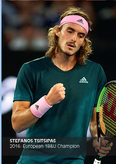
STEFANOS TSITSIPAS 2016: European 18&U Champion