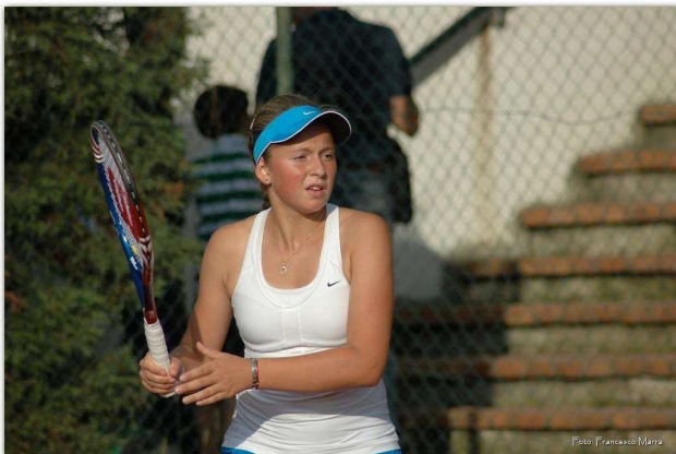
Jelena Ostapenko al CT Polimeni nel 2011