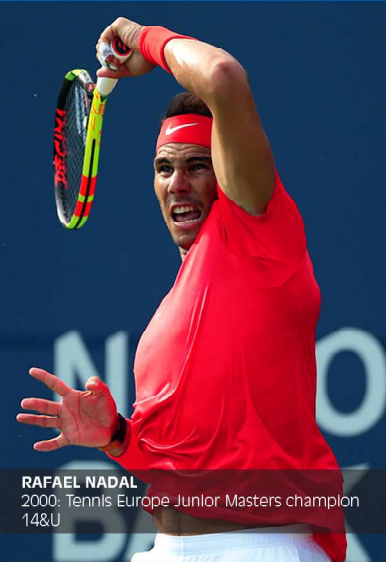
RAFAEL NADAL 2000: Tennis Europe Junior Masters champion 14&U