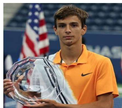
Lorenzo Musetti US Open 2018