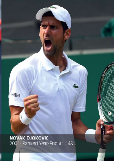
NOVAK DJOKOVIC 2001: Ranked Year-End #1 14&U