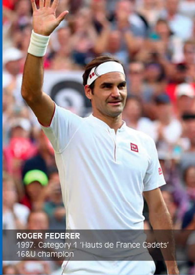
ROGER FEDERER 1997: Category 1 'Hauts de France Cadets' 16&U champion

1 TOUR 46 HOST NATIONS 110 NATIONALITIES 372 TOURNAMENTS 8,500 VOLUNTEERS 20,000 PLAYERS 53,250 MATCHES 230,000 BALLS 420,000 SPECTATORS