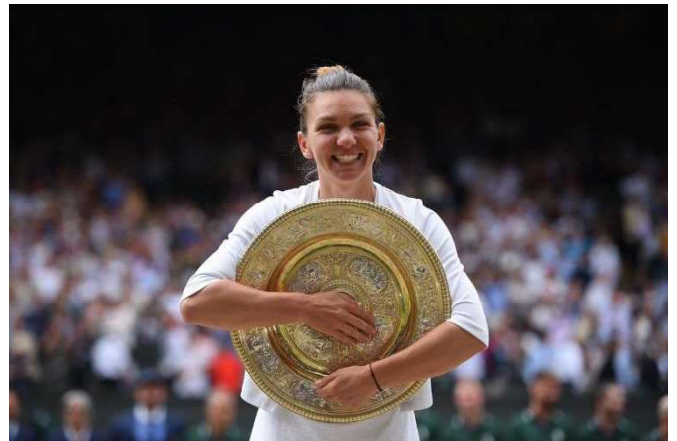
Simona Halep vincitrice Wimbledon 2019