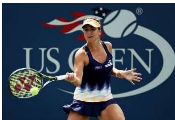
Belinda Bencic US Open 2019