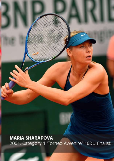
MARIA SHARAPOVA 2001: Category 1 'Torneo Avenir' 16&U finalist