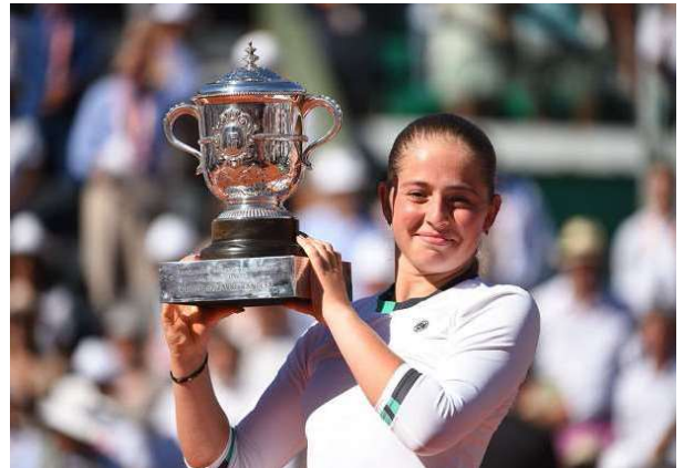
Jelena Ostapenko alza il trofeo Roland Garros 2017