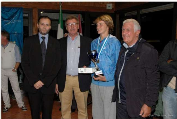
Alexander Zverev al CT Polimeni nel 2011