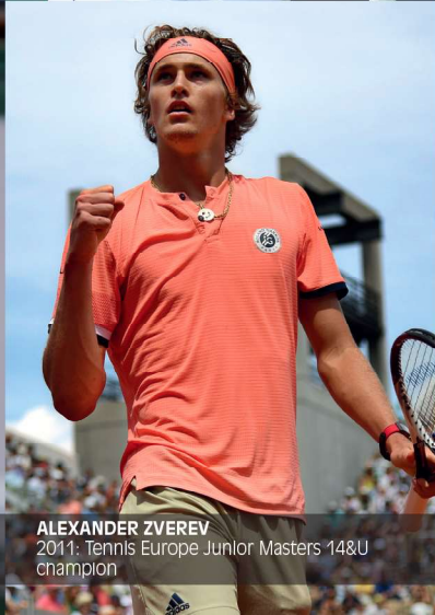
ALEXANDER ZVEREV 2011: Tennis Europe Junior Masters 14&U champion