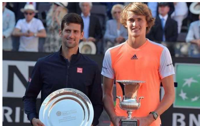
Alexander Zverev (n.4 ATP- vince Internazionali Italia 2017)