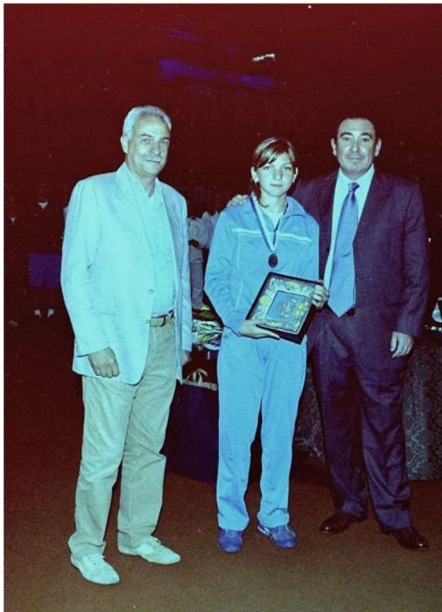
Simona Halep a CT Polimeni nel 2005